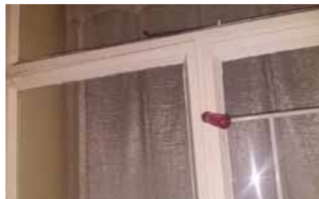
Criminals unsuccessfully tried to break in a house using a screwdriver.

For more information, contact Israel Maimane on 083 692 3038.