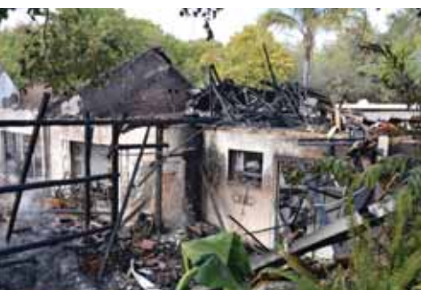
Firefighters battled the blaze, bringing the fire under control.

Rustenburg – People staying close to a property where a fire broke out on Tuesday night 16 June, took to social media, reporting that they heard what sounded like gun shots or crackers. Shortly after about 23h30, a concerned neighbour who noticed the smoke, sounded the alarm. At that time, a dark cloud of smoke was billowing from the property on the corner of Enkeldoring and Bakhout Avenue in Protea Park, causing poor visibility down the street. No one was injured in the fire which destroyed the garage, flat, lapa and part of the main house on the property.