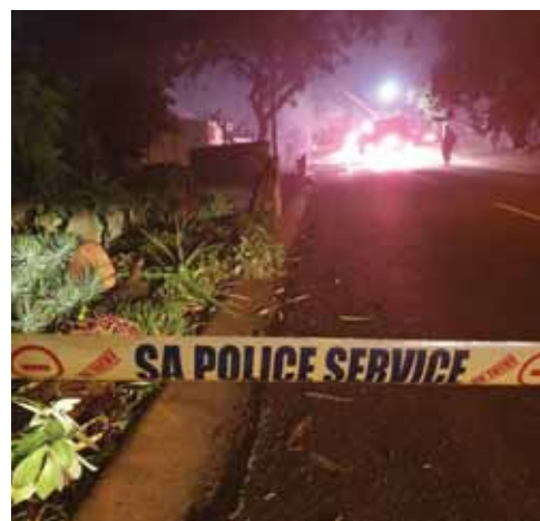
Community members assisted in signalling the Fire Department to follow them to the scene of the fire.

Firefighters battled the blaze for the next hour and a half, eventually bringing it under control at half past one on Wednesday morning. A neighbour told the Platinum Weekly : "I was still trying to figure out where the popping noises were coming from when we received a call from one of our neighbours. We were met by an orange glow when we went outside. I could see the flames towering up behind our garage, sending up sparks and cinders. It was terrifying." The cause of the fire, which apparently started in the garage, spreading to the flat and then to the lapa and main house on the property, is yet to be determined.